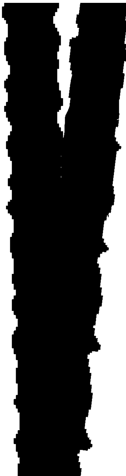
Pattern illustration 1:1