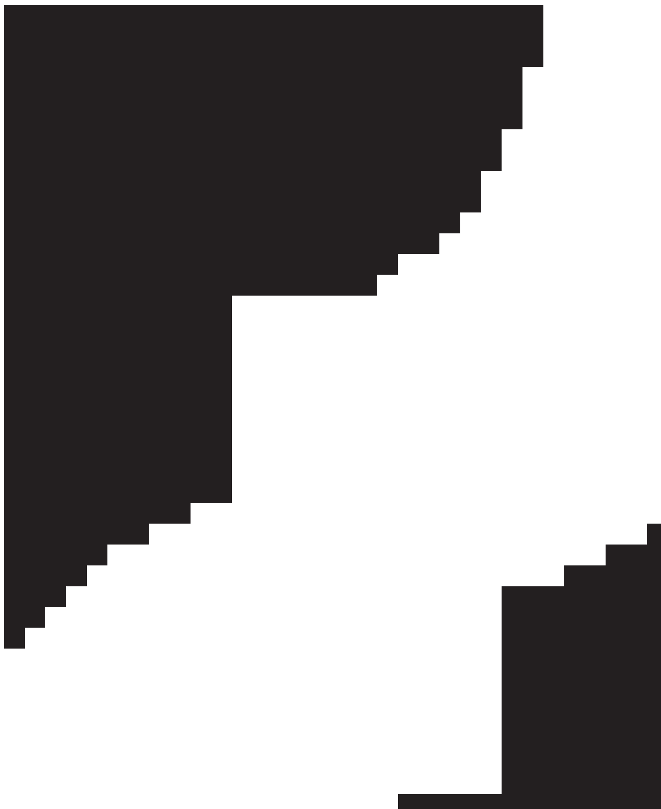
Pattern illustration 1:1