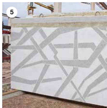
5 The end product is a patterned concrete element.