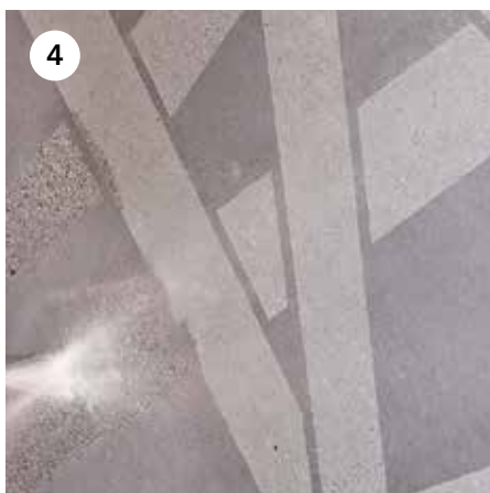
4 The slab is washed using a high pressure washer.