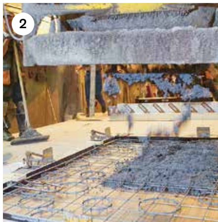
2 The mould is prepared and the slab is cast.